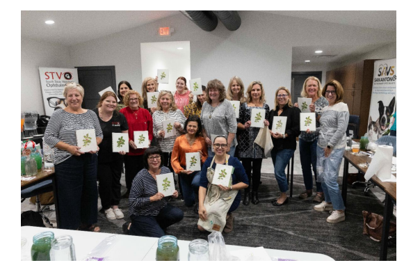
[Image: Group of attendees holding up their finished artwork at our recent Sip & Paint event. The artwork features green holly leaves with red berries.]