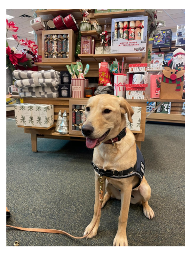
[Image: Guide dog-in-training Aurora with her mouth open and tongue out, in a sit-stay position in front of a holiday display at a store.]