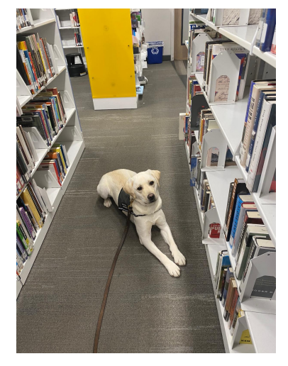
[Image: Guide dog-in-training Zola in a library in between stacks of books. She is in a down-stay position looking up at the camera.]