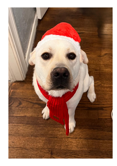
[Image: Guide dog-in-training Zebo with a Santa hat on his head and red scarf around his neck, in a sit-stay position looking up at the camera.]